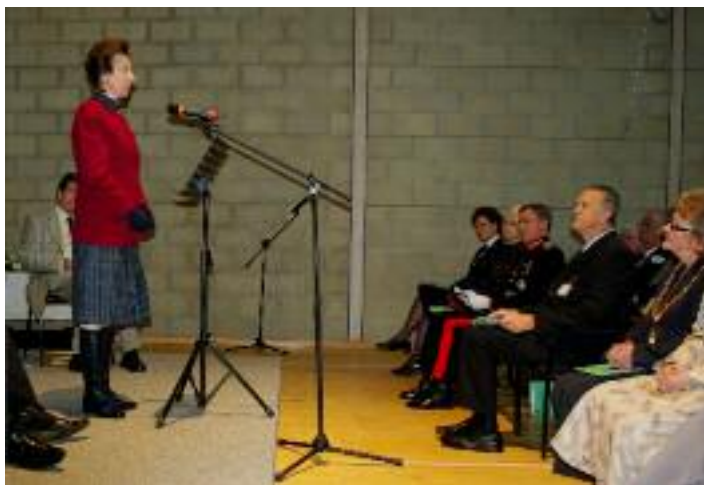
The Princess Royal's inspirational address

In an inspirational speech in the award winning Community Hall she called on rural communities to 'crack on' with affordable housing developments, saying they could 'make a huge positive difference' to those living in rural areas. "I would strongly encourage those who have thought about it...to give it a go" she said.