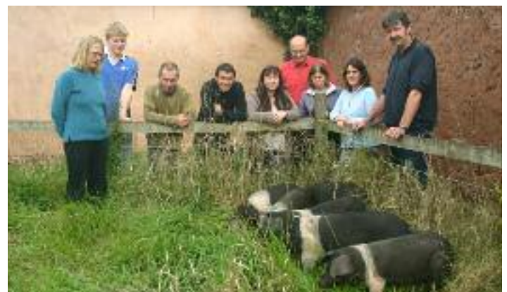
Broadclyst Community Farm's Livestock Group with their six young pigs