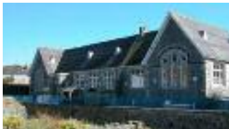
South Brent Old School Centre